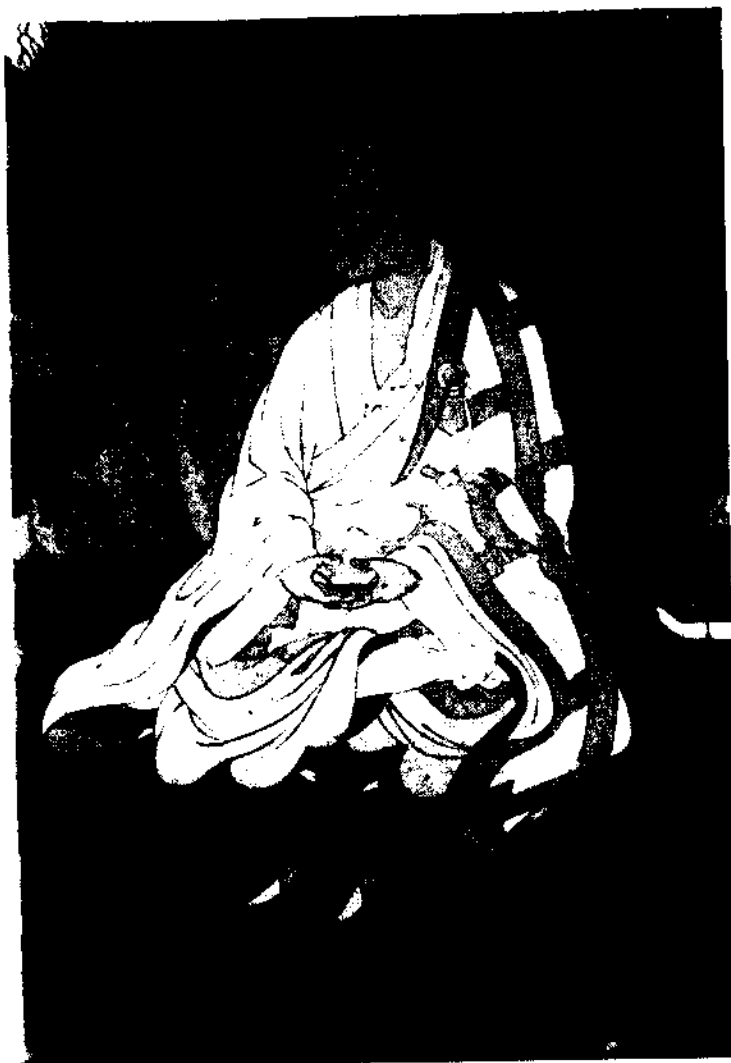
Figure 4. Ming Court Painting

for securing the outer robe was a ribbon attached to the part of the garment that draped over the back which was tied to a knot or ring attached to the part of the cloth draped over the front (figure 4). As this was one of the most conspicuous parts of the monk's robe, it attracted the attention of monks and others concerned with the image of the monk. The chief con-