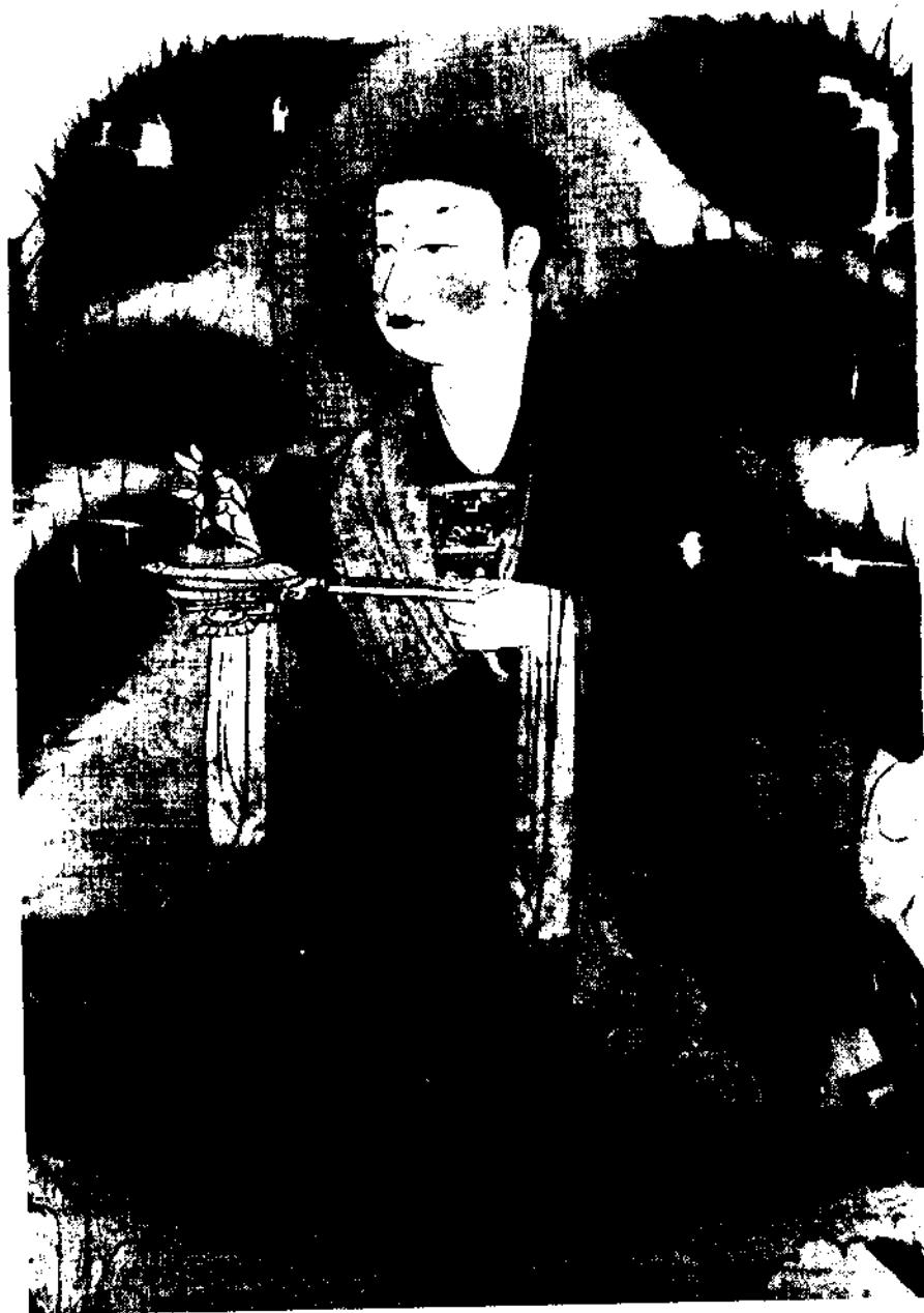
Figure 3. Nun in Tenth-Century Painting from Dunhuang

Note the separate garment covering the breasts.